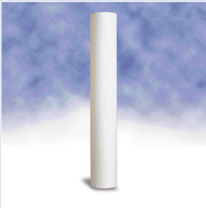
Liquid flow rate per 10 filter cartridge