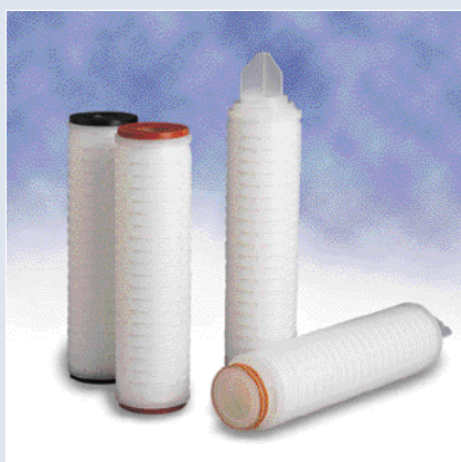
Liquid flow rate per 10 filter cartridge